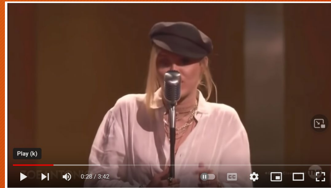
Miley Cyrus - Man Of Constant Sorrow (George Clooney Tribute)