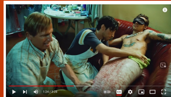
Harry Styles - Music For a Sushi Restaurant (Official Video)