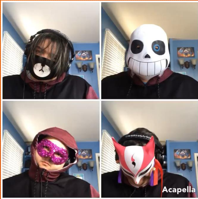
Mysterious Ticking Ostinati YT