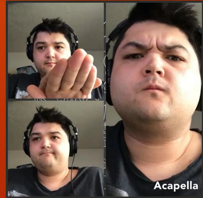
3 Part Partner Song YouTube