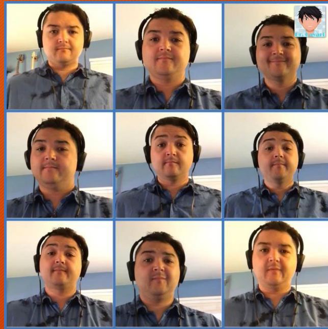
Jubilate Deo (Praetorius) Improv YT